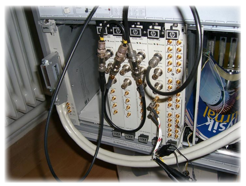
VXI crate with extender and group of digitizers. An empty and half open E1407C is used as a breakout box. Empty slots are ventilation blocked.

There was a certain difficulty to synchronize ADC clocks of several HP E1430A modules. They were installed in a E8401A crate with a NI VXI-MXI-2 extender module in Slot 0. The digitizer modules were next to each other with the master being the leftmost. A group was created in the software and synchronization was setup along the explanation in the E1430A user manual and the available software samples. During data taking it turned out that ADC clocks were synchronous, but sometime one or two of the four modules had lost a cycle or a fraction of a cycle. This could be demonstrated by sampling a 0.8 Vss 102.4 kHz sine wave at 10.24 MSamples/sec, triggering at 0.1 V.